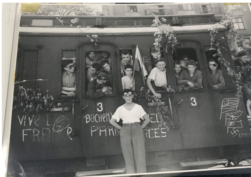
Figure 8: Photo of DPs departure on train, undated (1945-1948)

from the camp, moving towards a new place of settlement. They decorated the train, wrote messages of thanks and names and places with chalk onto the carriage and posed with flags for the photo. This was presumably a very important day, a caesura in the camp temporality, namely its end. A day to be remembered.