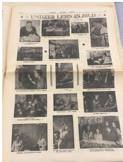
Figure 4: Yiddish camp newspaper “A Heim”, 1946, page “camp chronicle”. Headlines: “elections of new camp administration”, “announcements”