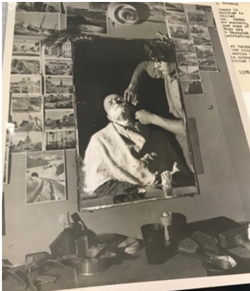
Figure 1: Photo of camp barbers' mirror with photos attached around. Hersfeld, Germany, undated (1943–1948).

depicted and enacted focused on culturally specific, national, ethnic, or local points of identity: hometowns, landscapes, religion, handicraft, music, or literature. Such specific cultural references among the groups dwelling in the camps are omnipresent in archived photos, but also in other files, like documentations of arts and handicraft exhibitions (Figure 2), religious practices, or an invitations to events, such as a ballet show. Such cultural camp life was mediated across various technologies, like in photos and reports on “camp history” in this example. In the corresponding report to Figure 2, it is even mentioned how the camp residents, through practices, “have been able to retain their individuality, develop new traditional skills and contribute toward the educational, cultural, and economic life of the camp community.”