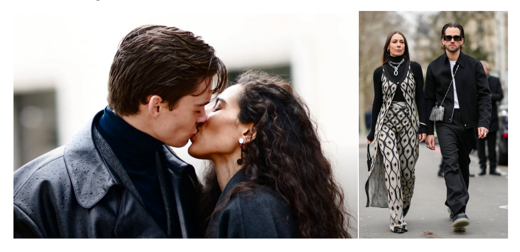
Figure 2: Heterosexual couples in Vogue. (V4 & V10)

The remaining pictures depict heterosexual couples (V4, V5, V10, Figure 2). The article on men's fragrances is focused on women, so it is depicted from a normative gaze: "it all depends on your partner's personality and even yours, because more and more women are using masculine scents and vice versa" (V5).