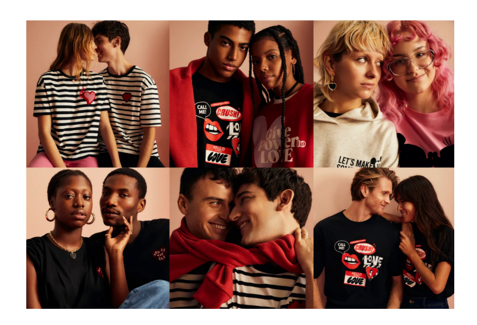
Figure 1: Lefties

The remaining pictures depict heterosexual couples (V4, V5, V10, Figure 2). The article on men's fragrances is focused on women, so it is depicted from a normative gaze: "it all depends on your partner's personality and even yours, because more and more women are using masculine scents and vice versa" (V5).